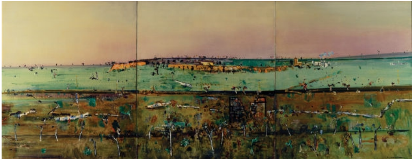
Fred Williams – Tarrawarra Museum of Art- Lilydale Triptych 1974