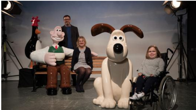
Wallace and Gromit ACMI