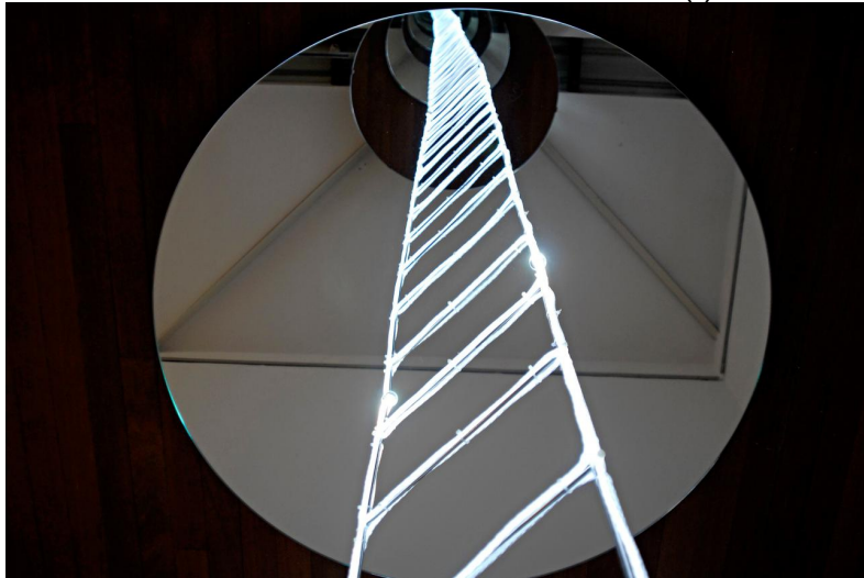
Yayoi Kusama – Tender are the stairs to heaven- 2004 NGV(I)