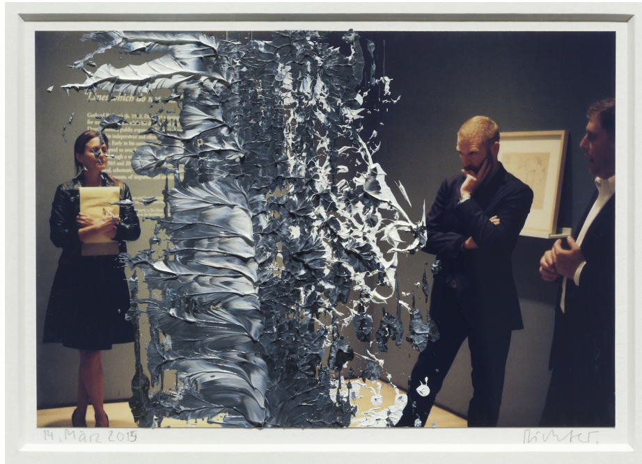
Gerhard Richter, Marz , 2015, charcoal and titanium white oil paint on colour photograph