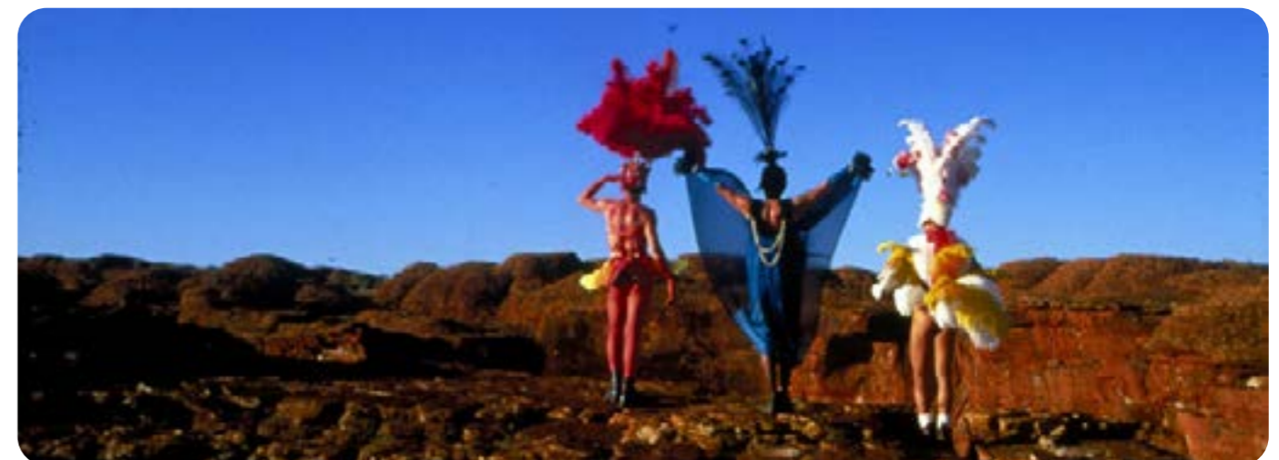
Still from 'the Adventures of Priscilla, Queen of the Desert', 1994