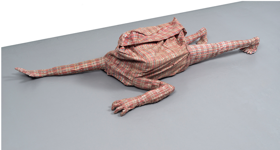
Dan Halter - Kuzuvva Dumbu - 2019