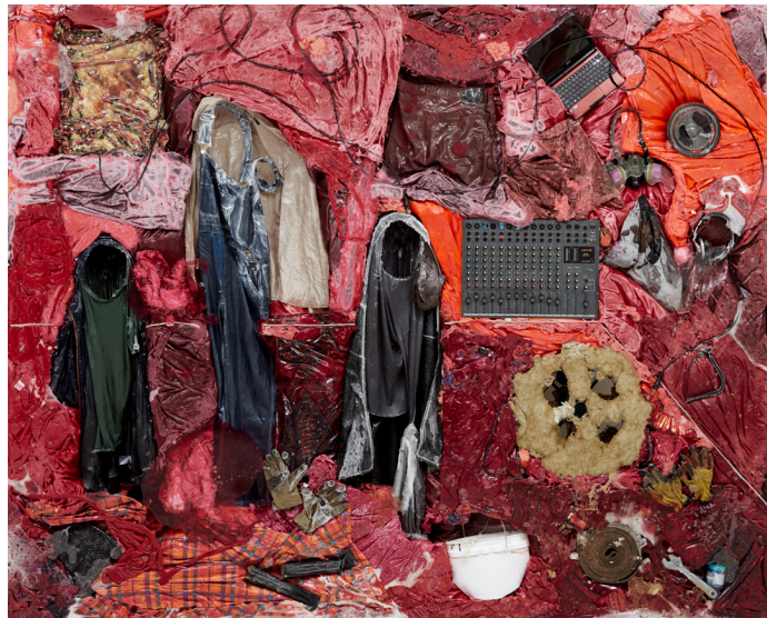
Kevin Beasley - The Acquisition - Resin, found materials and objects - 2018