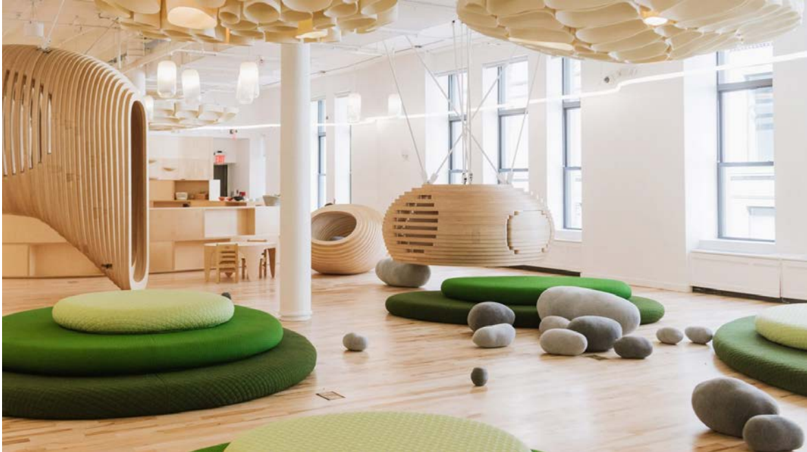
Bjarke Ingels Group, WeWork School , Chelsea NYC., 2018. https://www.dezeen.com/2018/09/12/wegrow-big-wework-elementary-school-new-york-city/ . Accessed 19 th Nov 2019.